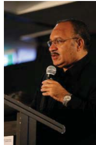
Prime Minister Peter O'Neill

Expanding the small business sector, managing urbanisation and developing modern communications were the Papua New Guinea Government's three priority areas, Prime Minister Peter O'Neill said last week.