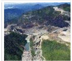
The Ok Tedi mine in PNG.

"The legal action we are taking will ensure that the company keeps control of the long-term fund so that it can be used wisely and effectively for the people of Western Province in the decades ahead."