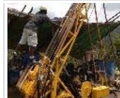
Drilling at Frieda River project in PNG.

Mill feed of 430Mt at 0.54% copper and 0.3 grams per tonne gold was assumed for average annual production of more than 100,000 tonnes of copper and 160,000 ounces of gold in concentrate at cash costs of around $1.25 per pound over an 18-year mine life.