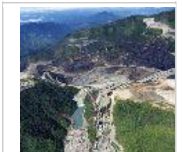
The Ok Tedi mine in PNG.

Talks about the expropriation of Ok Tedi dominated conversations among workers and speculation was rife.